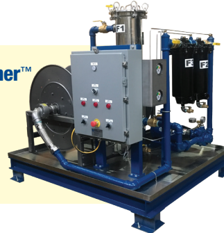
PetroPolisher™ Skid Ideal for mobile truck and trailer mounting