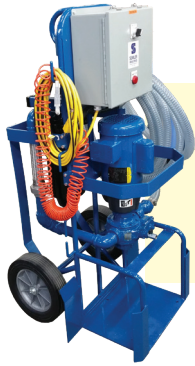
PetroPolisher™ Cart Ideal for tanks 1,000 gallons or less