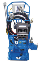
Oil Transfer Carts