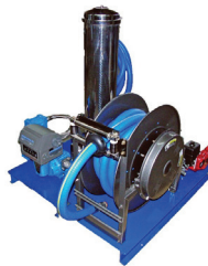
DEF Transfer Systems