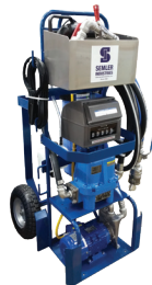
DEF Transfer Carts