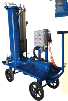
PetroPolisher™ Wagon Ideal for filtering, polishing and transferring on tanks with 1,000 - 10,000 gallons