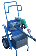
Portable Fuel Transfer Systems