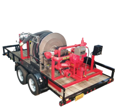
Transfer Wagons or Trailers